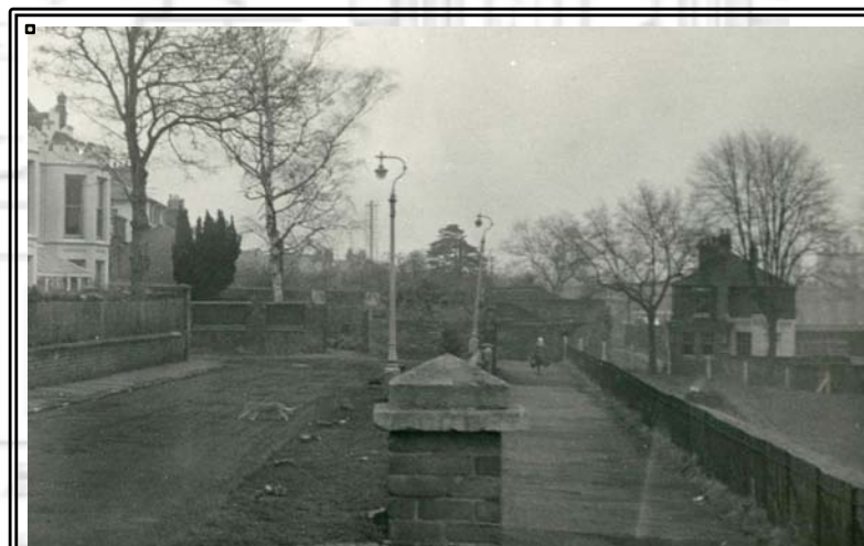
Photograph of Stephenson Terrace

Please return this page to: Ian Terry, 14 Albany Terrace